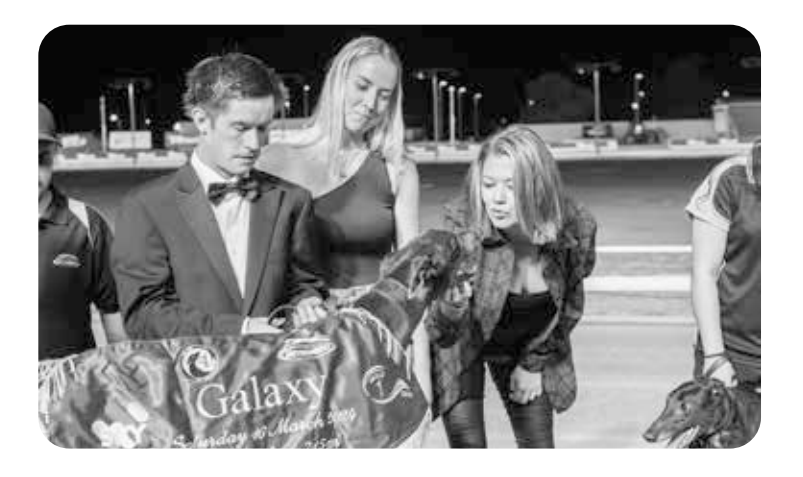
WEST ON BOONIE - GALAXY WINNER 2024